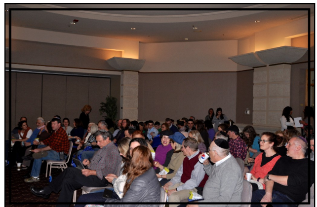
Over 100 people waiting to see "2e: Twice Exceptional" at the