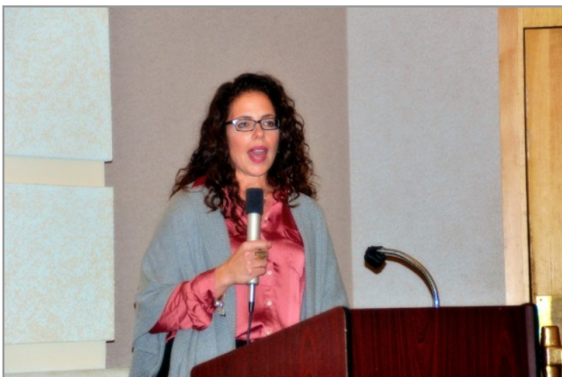
We had a great turn out at our